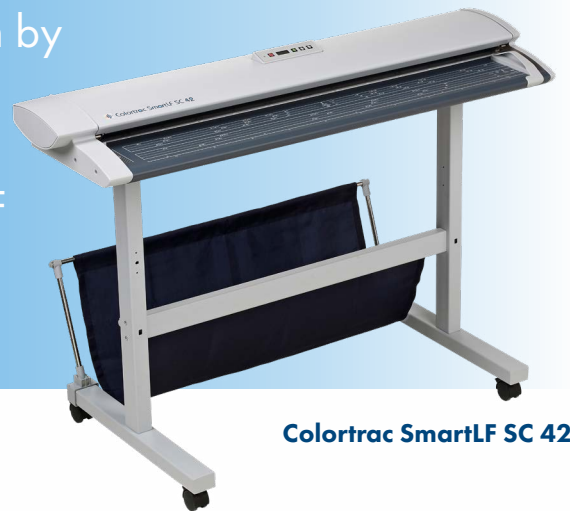
Colortrac SmartLF SC 42

Our large format scanning service is driven by experienced operatives, procedures and innovative large format scanning technology including the Colortrac SmartLF SC 42 which produces high quality scans of documents up to a width of 42 inches.